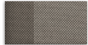
1 Medium Light Stone Cloth with Medium Dark Stone Accents