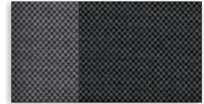
2 Charcoal Black Cloth with Warm Steel Accents