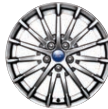
17" Sparkle Silver-Painted Aluminum Standard