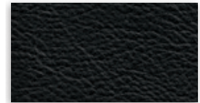
4 Charcoal Black Leather