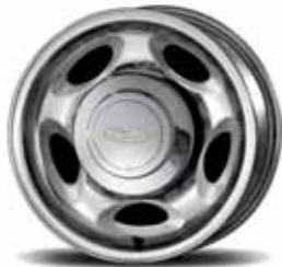
16" Aluminum Available