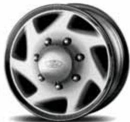
16" Steel with Sport Wheel Covers Standard