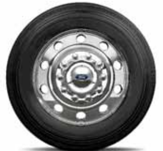
Polished Aluminum with Optional Wheel Ornamentation (front)