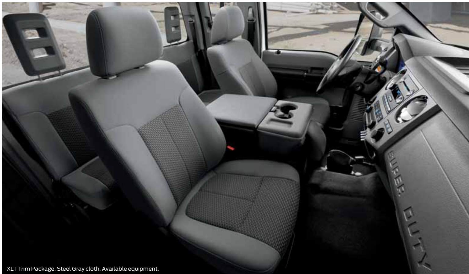
XLT Trim Package. Steel Gray cloth. Available equipment.