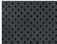
Black Leather Standard on Limited