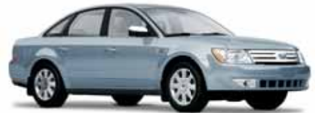
Light Ice Blue Metallic