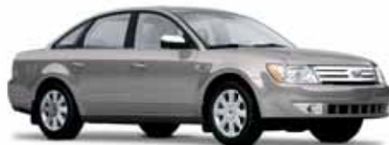
Silver Birch Metallic