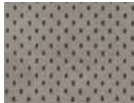
Medium Light Stone Leather Standard on Limited; Available on SEL