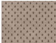
Camel Leather Standard on Limited; Available on SEL