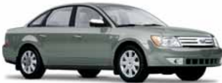
Titanium Green Metallic