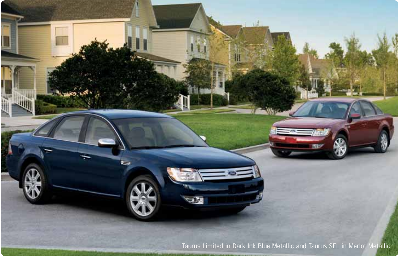
Taurus Limited in Dark Ink Blue Metallic and Taurus SEL in Merlot Metallic