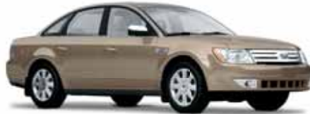
Dune Pearl Metallic