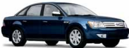
Dark Ink Blue Metallic