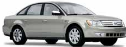
Light Sage Metallic