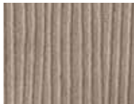
Camel Cloth Standard on SEL