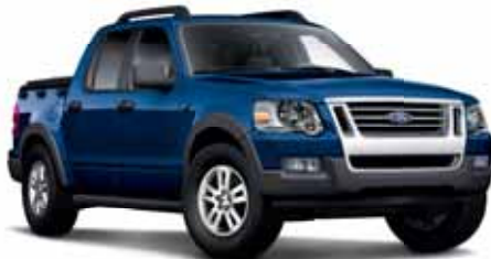
Dark Blue Pearl Metallic