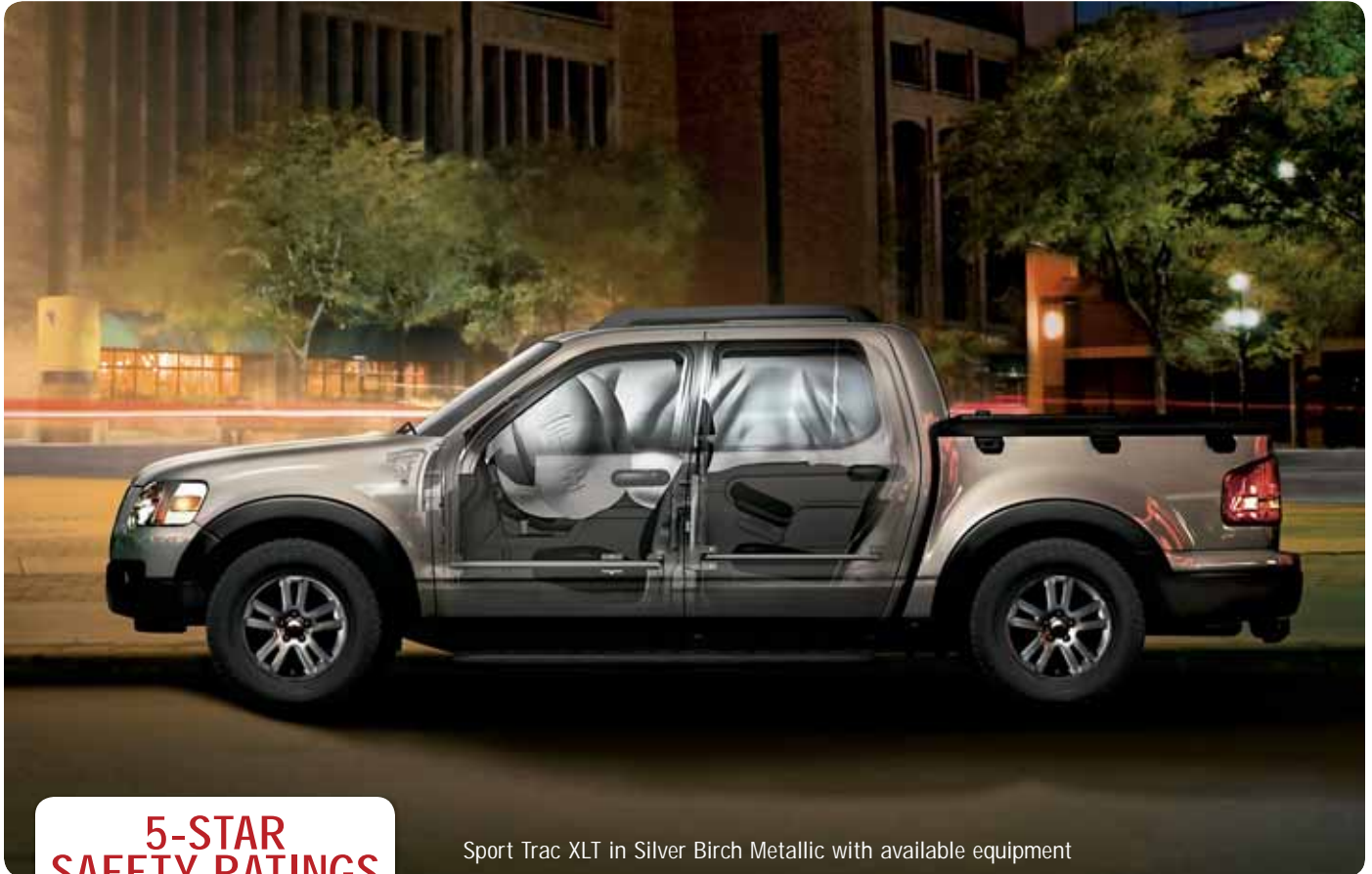
Sport Trac XLT in Silver Birch Metallic with available equipment