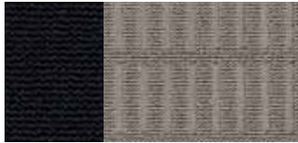
Charcoal Black Cloth with Medium Light Stone Inserts Standard on Limited