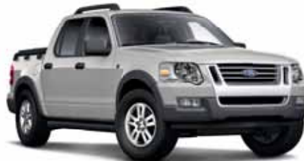
Silver Birch Metallic