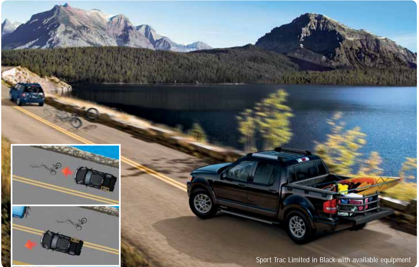
Sport Trac Limited in Black with available equipment