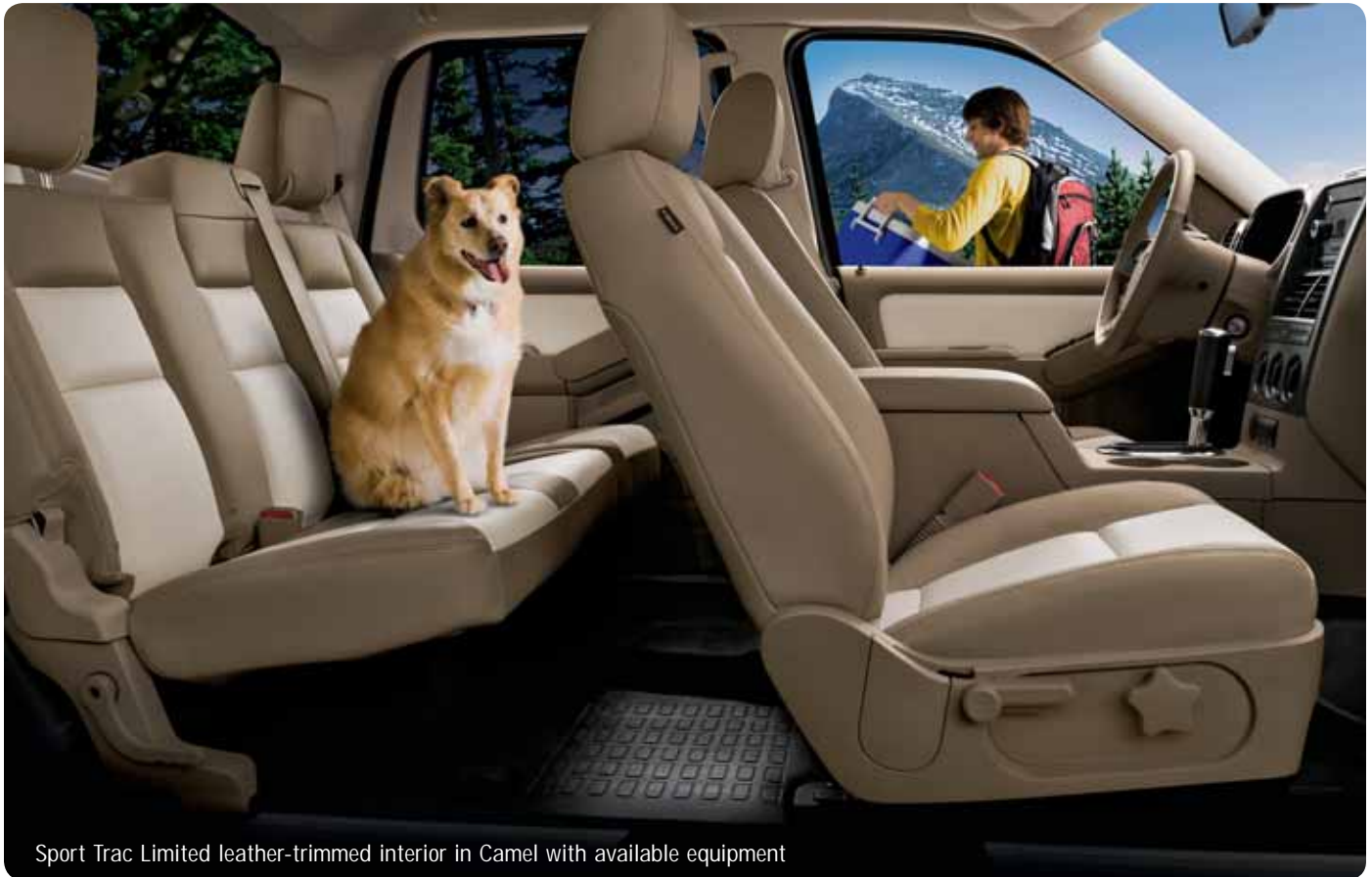
Sport Trac Limited leather-trimmed interior in Camel with available equipment