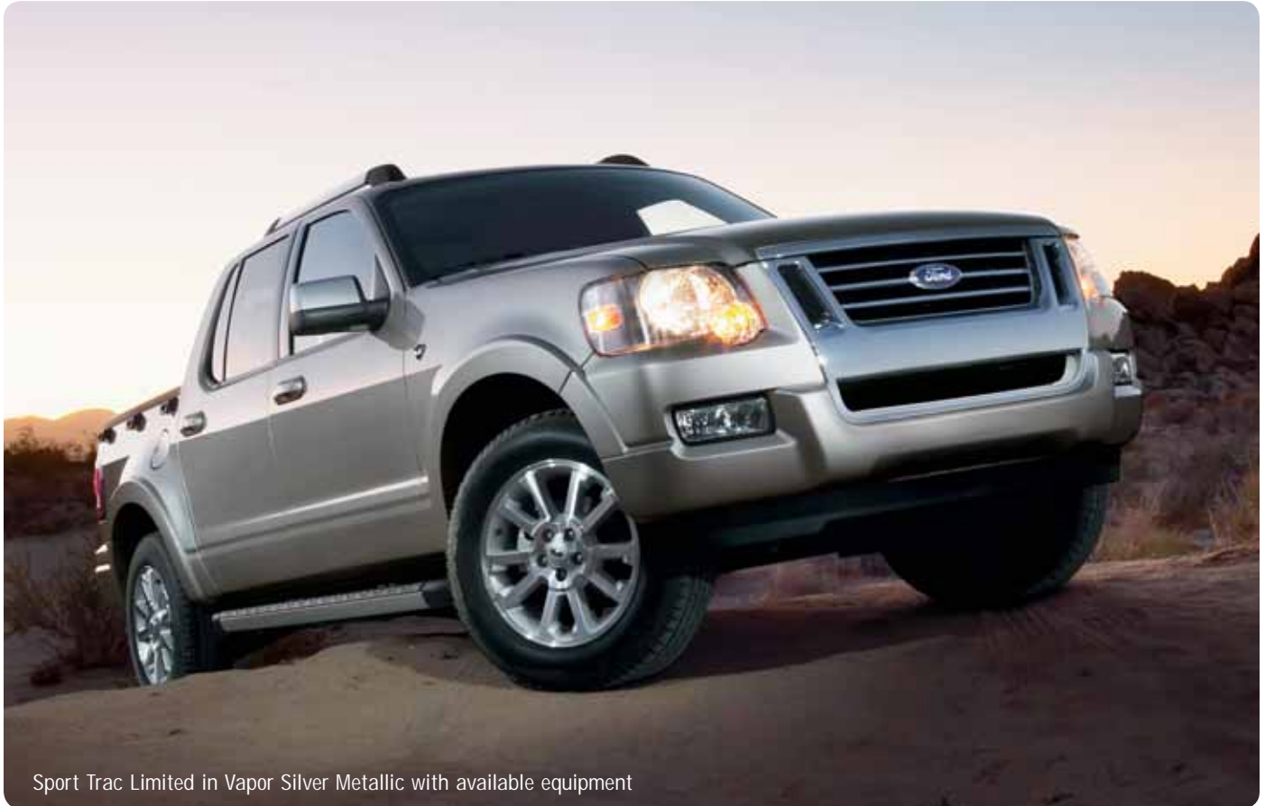
Sport Trac Limited in Vapor Silver Metallic with available equipment