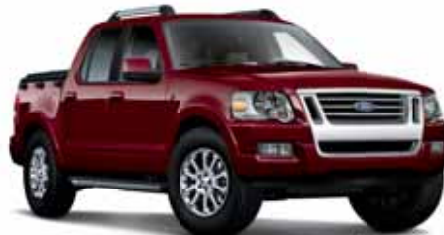
Dark Cherry Metallic

Ford uses clearcoat paint for beauty and protection. Colors shown are representative only. Not all colors are available on all models. See your dealer for actual paint/trim options. Vehicles shown may contain optional equipment.