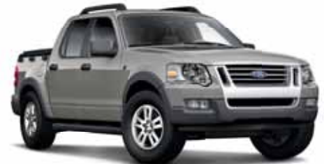
Vapor Silver Metallic