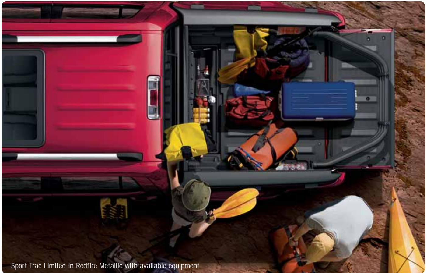
Sport Trac Limited in Redfire Metallic with available equipment