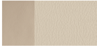
Camel Leather with Sand Inserts Optional on Limited