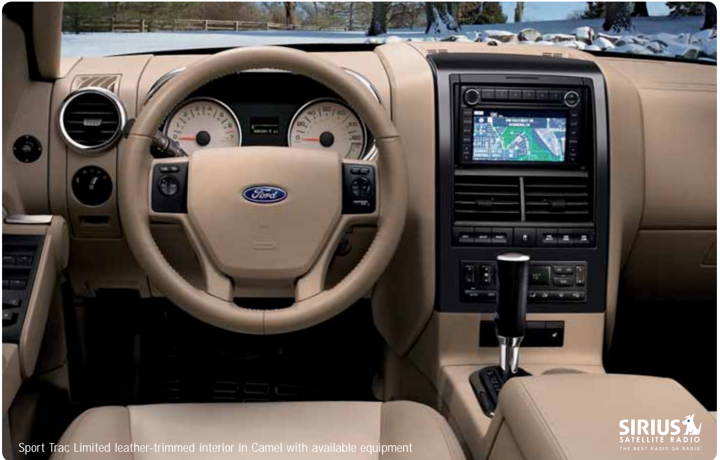
Sport Trac Limited leather-trimmed interior in Camel with available equipment

SIRIUS SATELLITE RADIO THE BEST RADIO ON RADIO