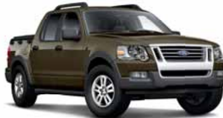
Stone Green Metallic